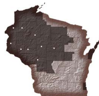
Our service area & office locations.

We are committed to providing quality, individualized, outcome based services. ACS currently provides services through northern & west central Wisconsin.